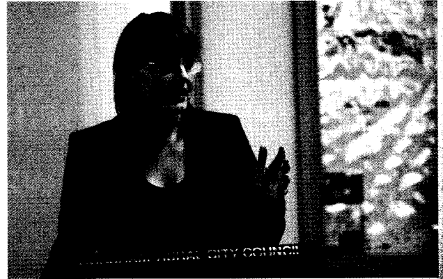
Jacinta Allan, Victoria's new Minister for Regional and Rural Development, Industry and Trade.